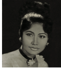
Singer: Ros Serey Sothea

MEMORY & JUSTICE www.dccam.org | www.cambodiasri.org