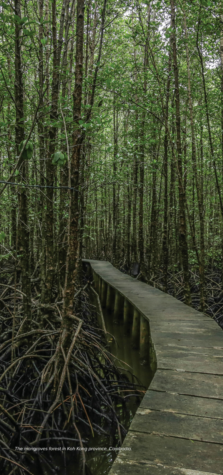
The mangroves forest in Koh Kong province, Cambodia.