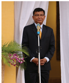
H.E. Dr. Hang Chuon Naron, The Minister of Ministry of Education, Youth and Sport of Cambodia.